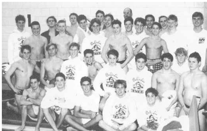
1990-91 CBA Swim Team