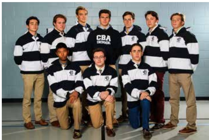
Class of 2017