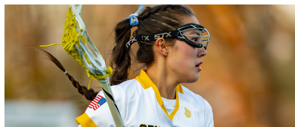
Centerville girls lacrosse vs Springboro.