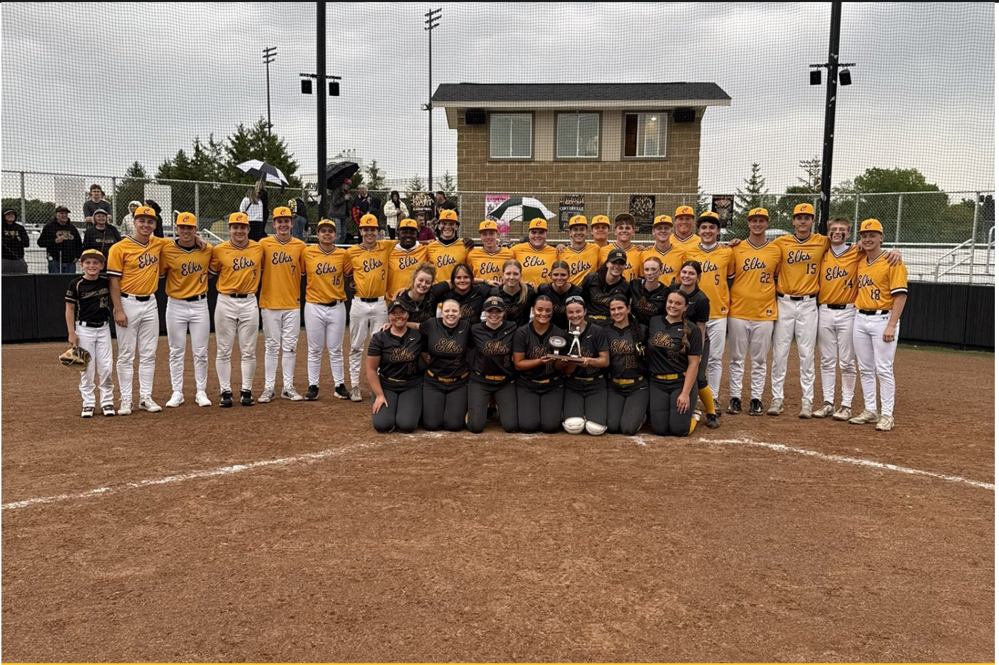
Centerville baseball and softball celebrate together after both programs clinched GWOC titles this week — baseball 14-0, softball 13-1.

Week of May 4–10, 2026 Seven Sports · Spring 2026