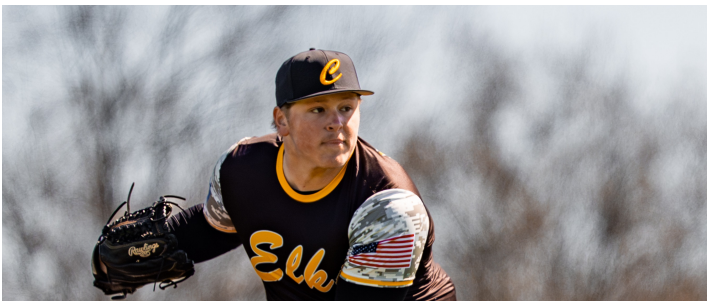
Centerville baseball vs. Elder.