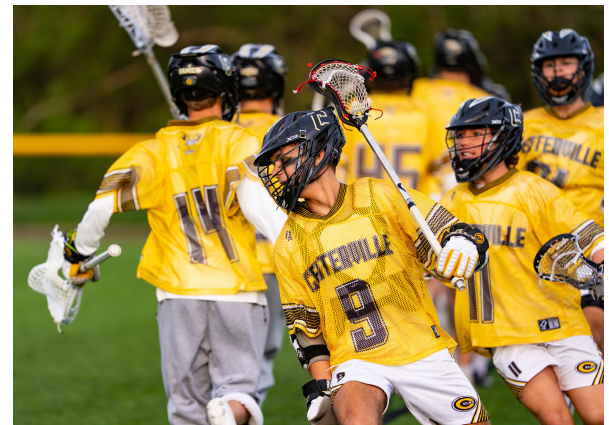
Centerville boys lacrosse vs. Gahanna.