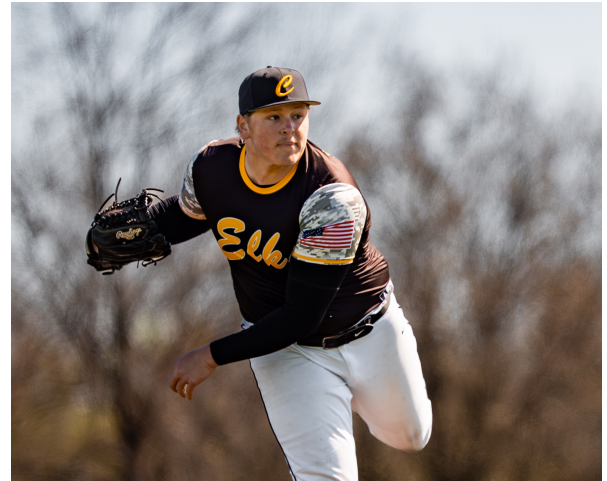
Centerville baseball vs. Elder.

The offense leads the GWOC in stolen bases (58) and runs scored. The pitching staff is third in conference ERA (2.75) with 96 strikeouts. Bronson Weng (So, #9) is hitting .480 with a .567 OBP while posting a 1.56 ERA on the mound. Ryan Sidwell holds a 0.00 ERA.