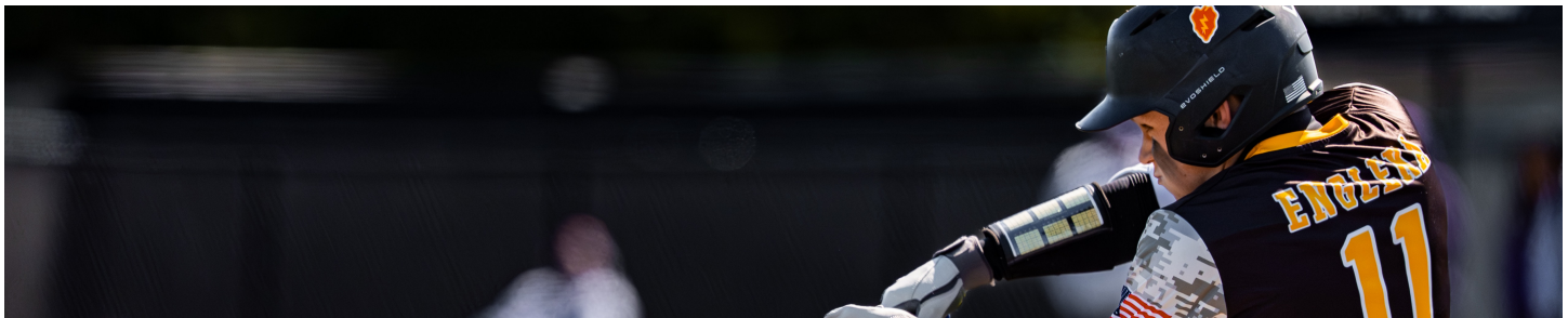
Centerville baseball vs. Elder.