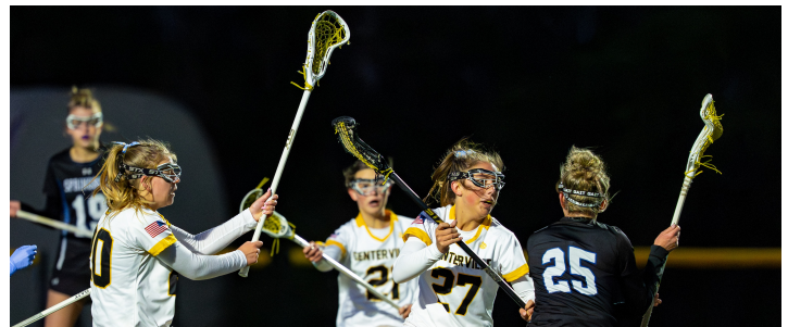
Centerville girls lacrosse vs. Springboro.