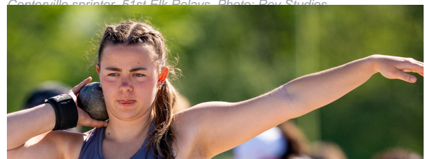
Centerville field athlete, 51st Elk Relays.