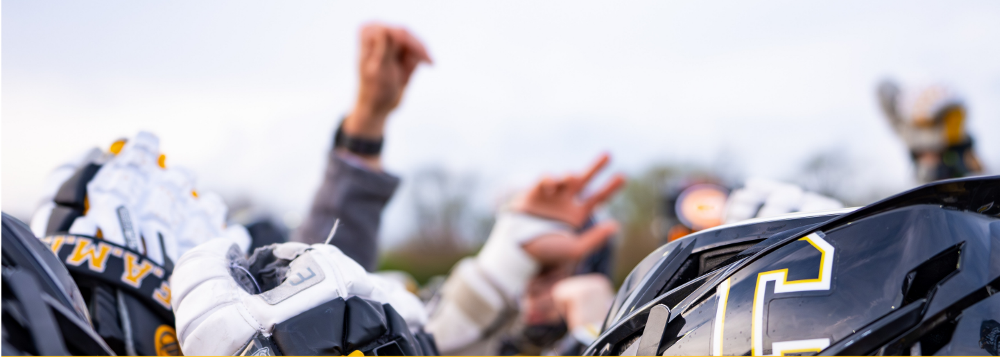
Centerville boys lacrosse celebrates their 15-14 OT win at Olentangy Orange on Saturday — perfect in GWOC play at 2-0.

Week of April 20-27, 2026 Seven Sports · Spring 2026