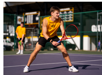
vs Bellbrook · Rev Studios