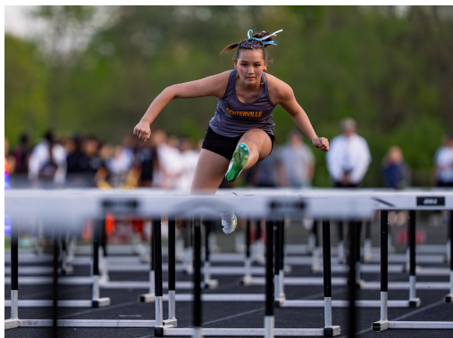
Hurdles action at the Elk Relays