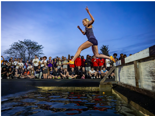
Steeplechase water jump at the 51st Elk Relays

On the relay side, the girls squad was dominant across distance events: wins in the 4x1600 (22:31.20, edging Turpin by one second), 4x4000 DMR (13:06.53), 4x800 (9:57.19 — edging Mason by less than a second), and 800 Sprint Medley (1:47.41). The boys won the 1000 Sprint Medley in 2:00.55. Ashlyn Rickert (Sr) cleared 11-3 in the girls pole vault for 2nd place.