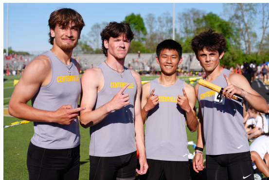
Boys 1000 Sprint Medley relay team — 1st place