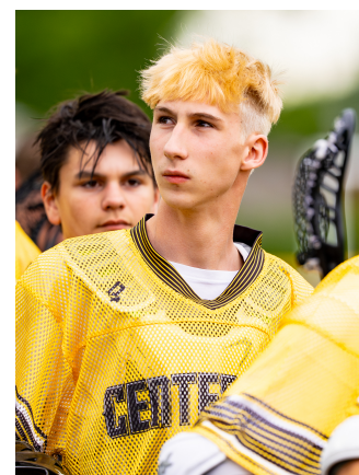
vs New Albany