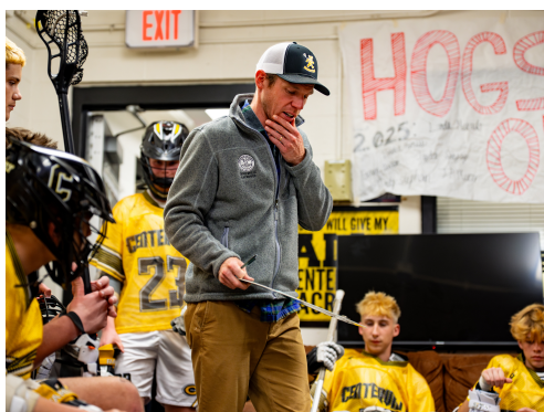
Boys lacrosse coach addresses the team

The road win at Springboro carries particular weight — Springboro was 1-4 overall entering the game but had won their GWOC opener, and a road GWOC win in the first conference game of the year sets a strong tone. The 19-10 score shows offensive depth that can sustain through a full GWOC slate. The April 14 game at St. Charles has no result posted and may have been postponed or not yet entered.