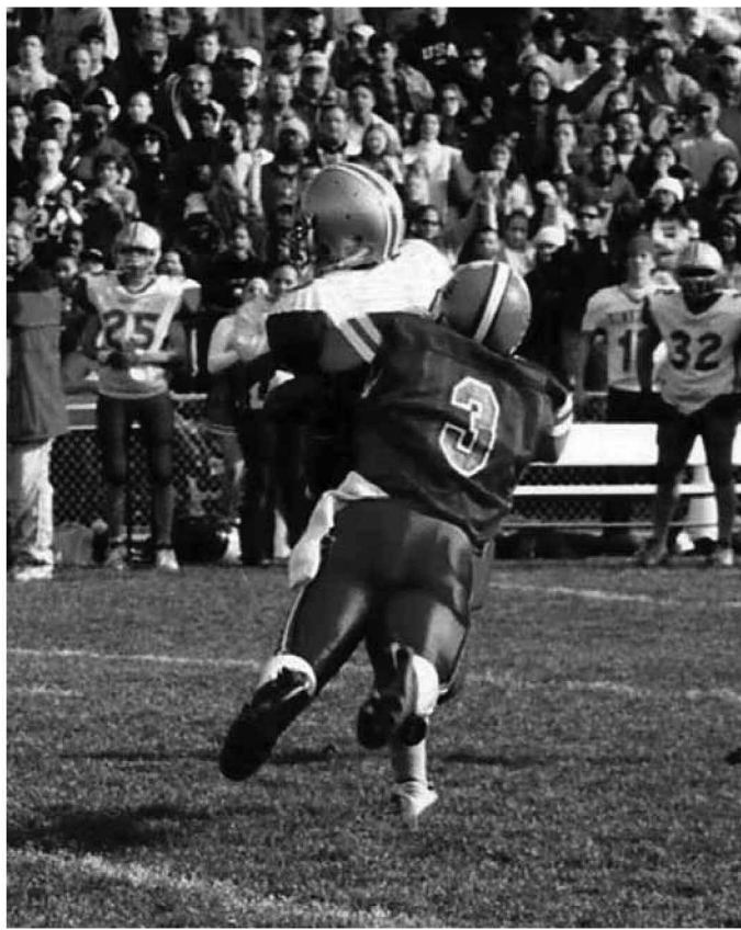
Figure 2. Initiating contact with the shoulder while keeping the head up reduces the risk of head and neck injuries.

down position and at risk of serious injury. Evidence Category: C